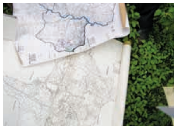
Using maps to help design and implementation